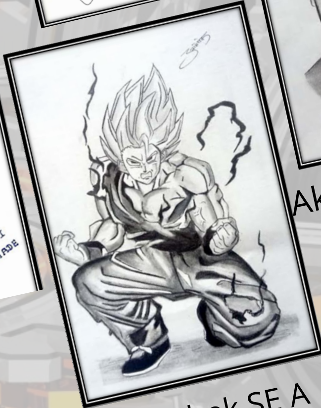
Abhishek SE A