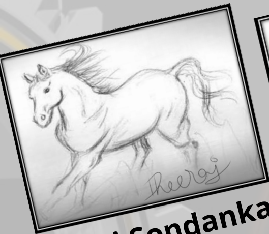
Dheeraj Sondankar TE B