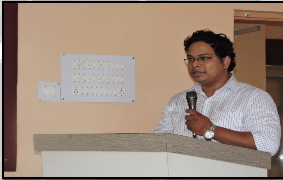
4. Hands-on OSA was held on 8 th July 2015.