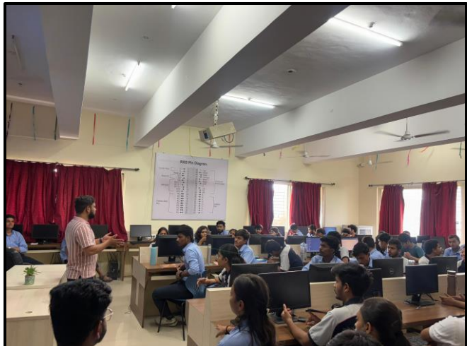
Some glimpse of the seminar on Application development in real world