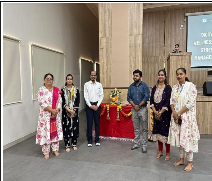
Maa Saraswati Vandana