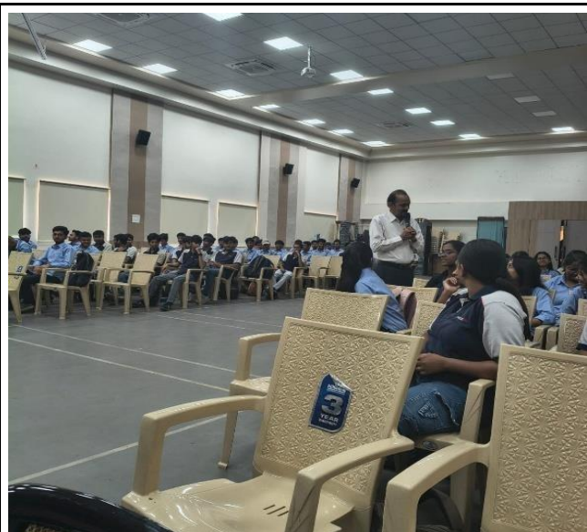
Interaction with the students.