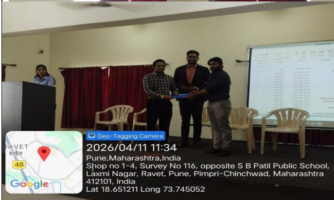
Guest Felicitated with Award