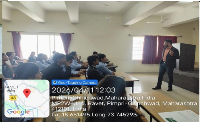
Speaker Elucidates the Concept