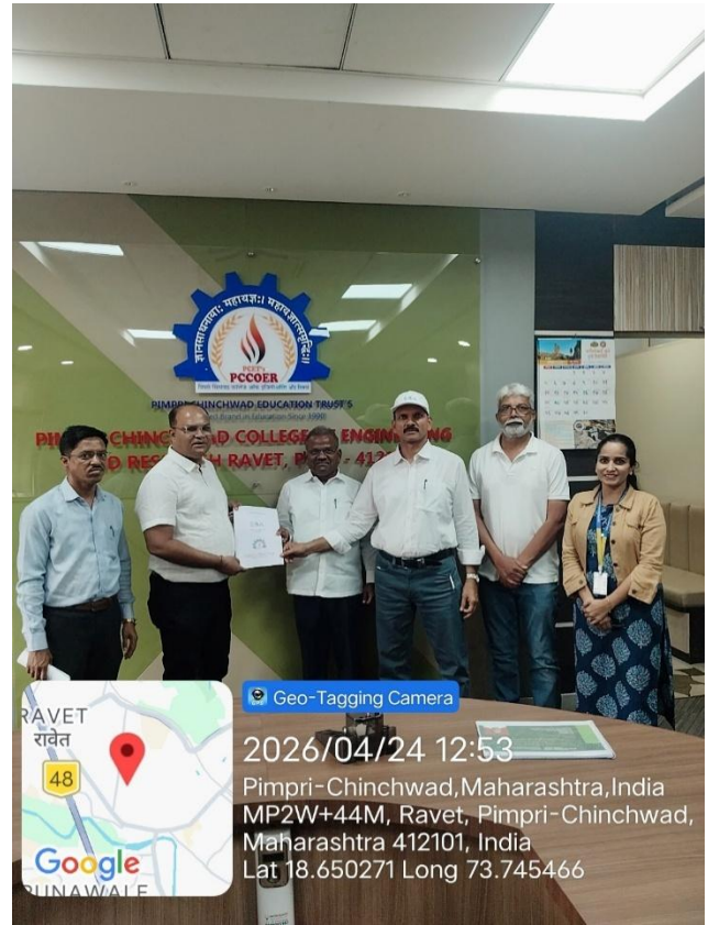
MOU Signed between BBA & BCA Department & Environmental conservation Association.