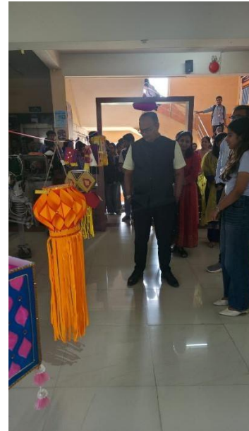
JUDGES AND SELLERS OF THE EVENT