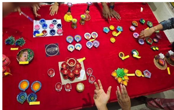
BEAUTIFUL AND CREATIVE