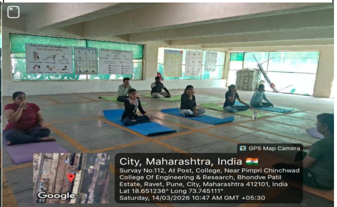
Yoga session focused on pranayam