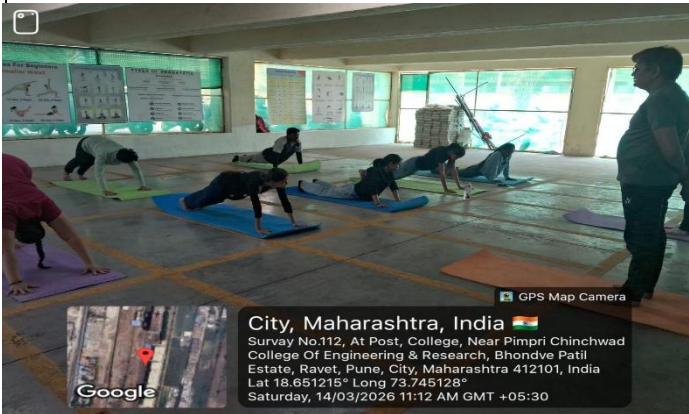
Students practicing yoga under guidance