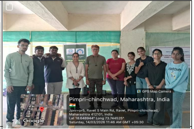
Group photo with the students