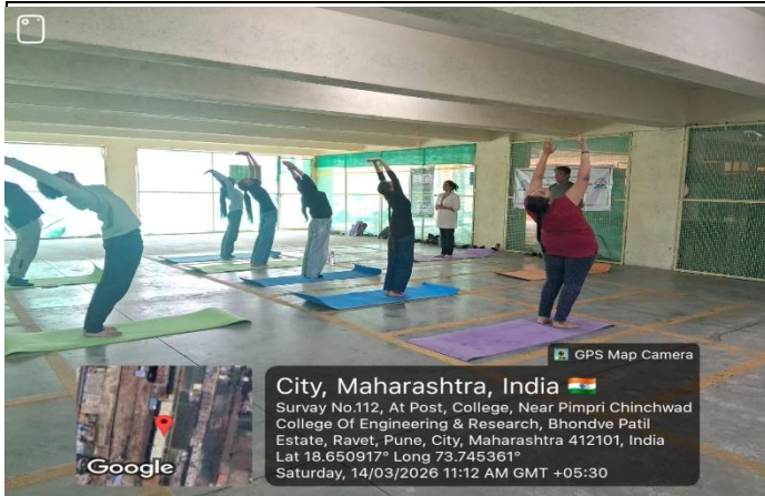
Group yoga practice.