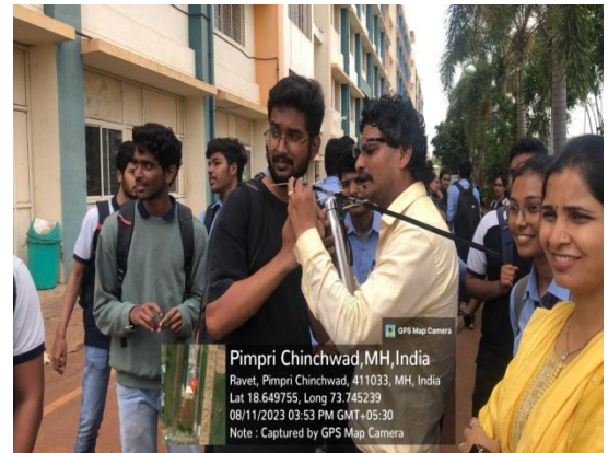
3 Days Hands-on workshop on Antenna Design & Fabrication