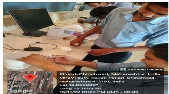
Solar Lantern Making