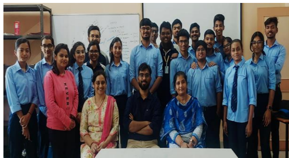
One Week Capacity Building Workshop